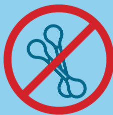
Cotton (Cotton swabs or balls)