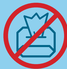
Wipes (Baby or flushable)