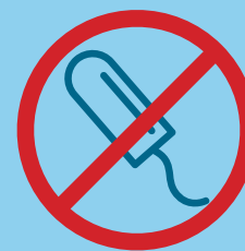
Feminine hygiene products